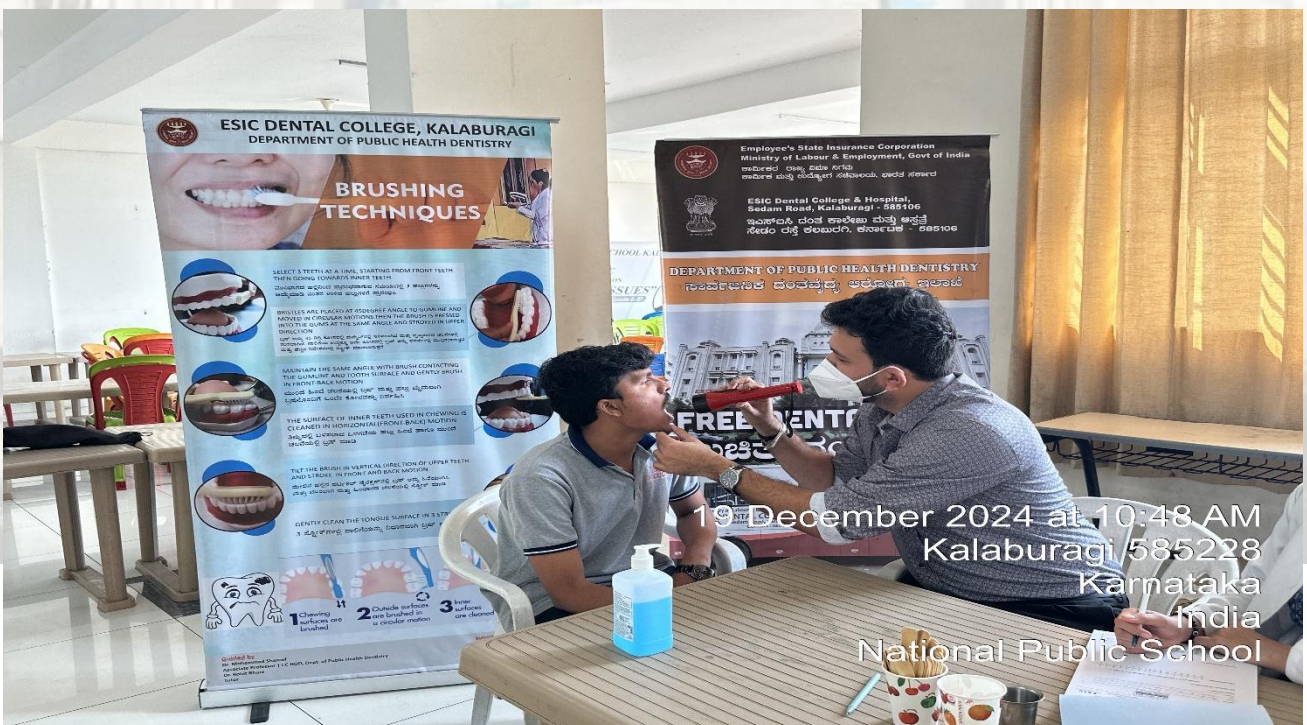
19 December 2024 at 10:48 AM Kalaburagi/585228 Karnataka India National Public School