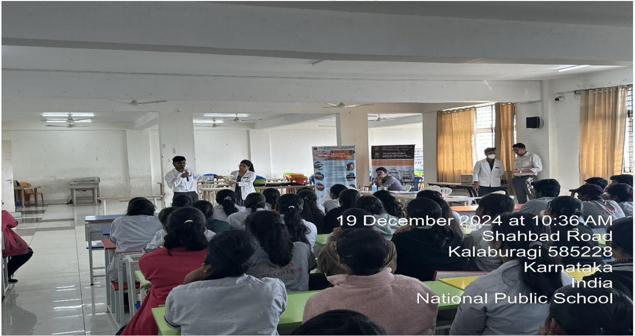
19 December 2024 at 10:36 AM Shahbad Road Kalaburagi 585228 Karnataka India National Public School